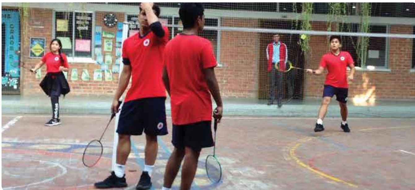
Badminton action at CISB.