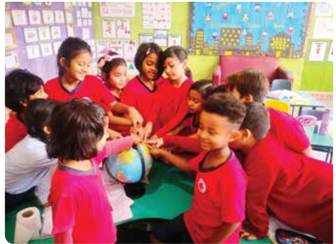
Understanding the hemispheres, poles, equator, continents, and oceans on a globe.