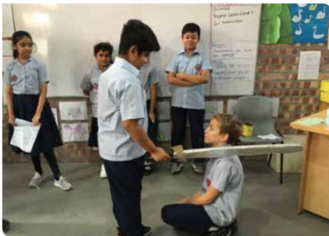
This is the grand dubbing ceremony in which our gallant squire is about to become a knight.