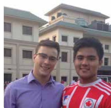
7 v 7 Soccer League - Boys finished with Silver.