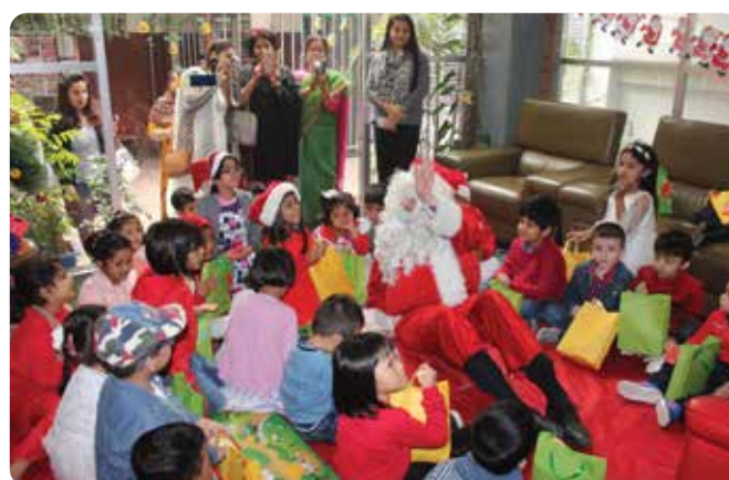
Santa Claus at CISB