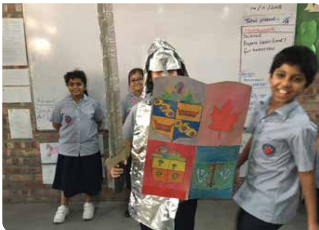
Here is our knight going off to save us with his shield, sword, armour, and bravery.