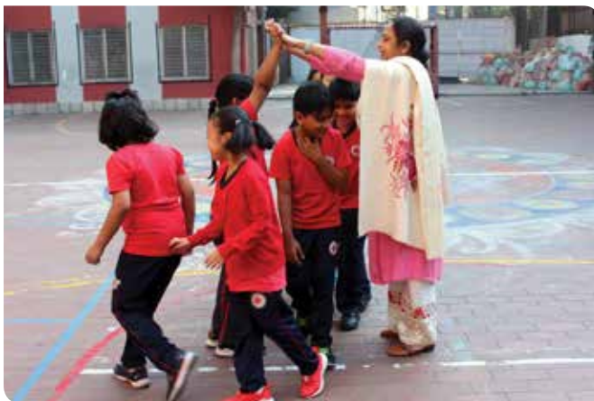
Grade ones enjoying a game with their teacher.