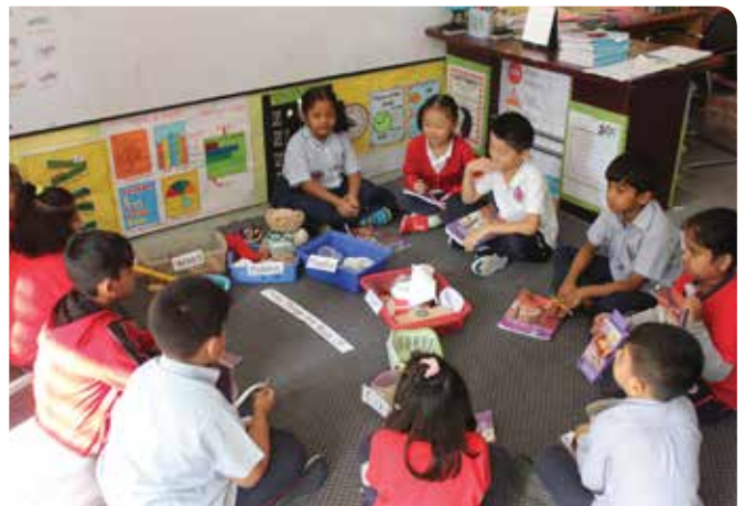
Inquisitive minds exploring different materials and wondering where they all come from.