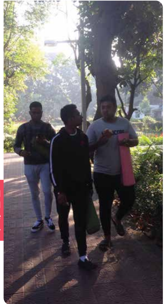
A casual stroll through the park.