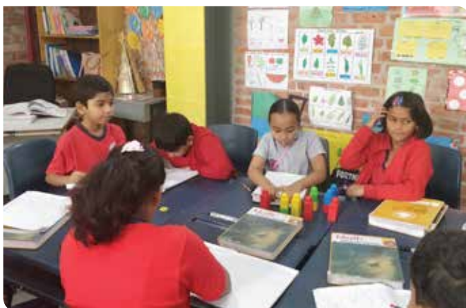
Budding artists of Grade 3.