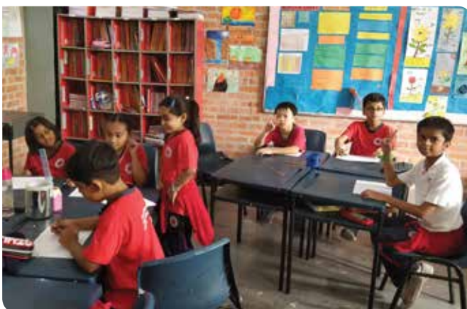
Working together on arrays.