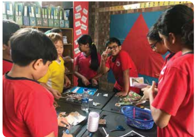
Grade five girls enhancing their oral presentation skills by giving a sports' commentary!