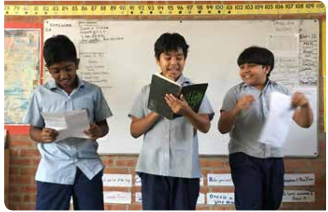
Grade Five enthraling the class with 'A live Sports Commentary'.