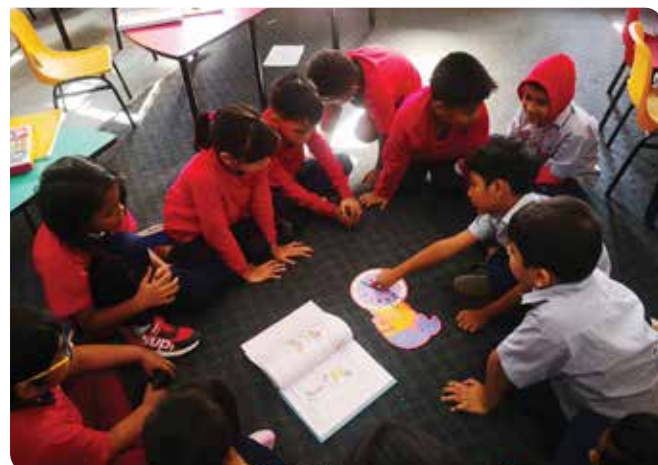
Learning to tell time to the quarter-hour on the analog clock.