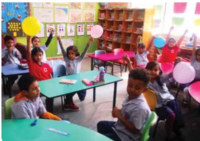
Conducting experiments to determine that air takes up space with 'The Balloon Experiment'.