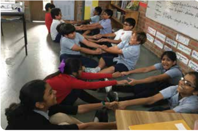
Grade 5 testing their endurance while playing Ac Sa Raq, a cool Inuit game in their English period.