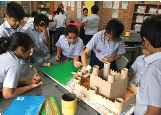
We are making a model of a medieval castle to display its features and functions.