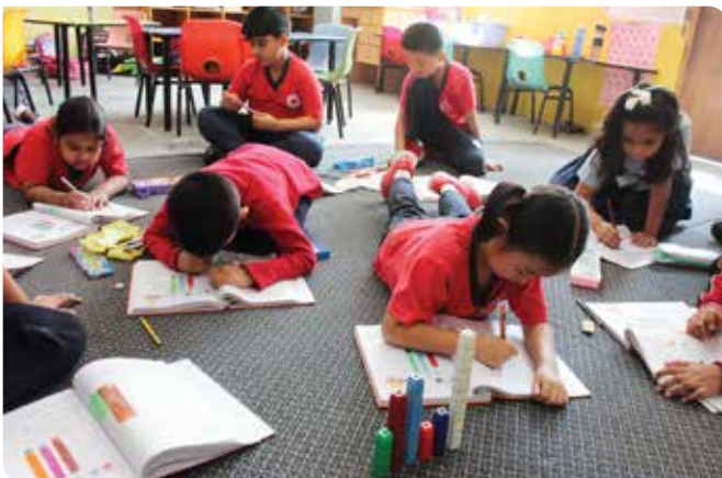
Grade ones made a bar graph with snap cubes. Later, they got busy interpreting their data and doing it in their math work book.