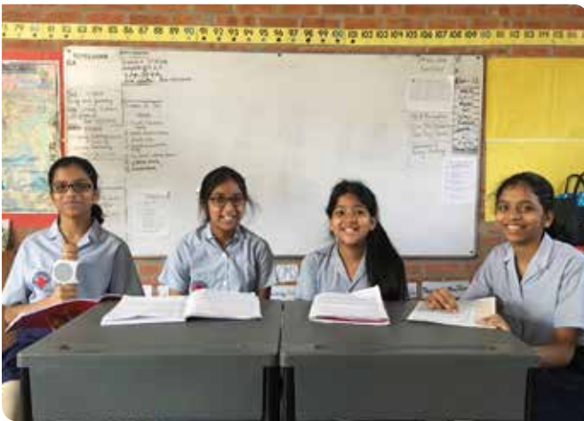
Grade Five girls enhancing their Oral Skills by giving a Sports' Commentary!