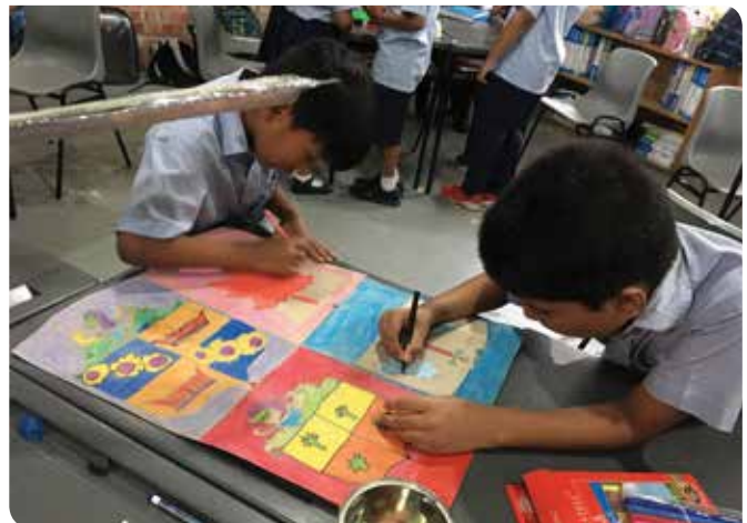
Did you know that medieval knights had their coat of arms painted on their shield?