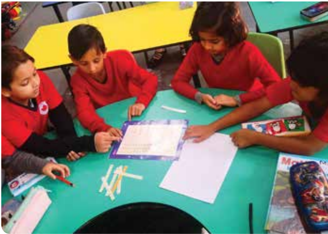
Subtraction on the place value mat.