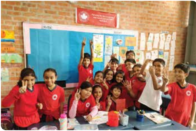
Happy to celebrate a friend's birthday with a handmade card.