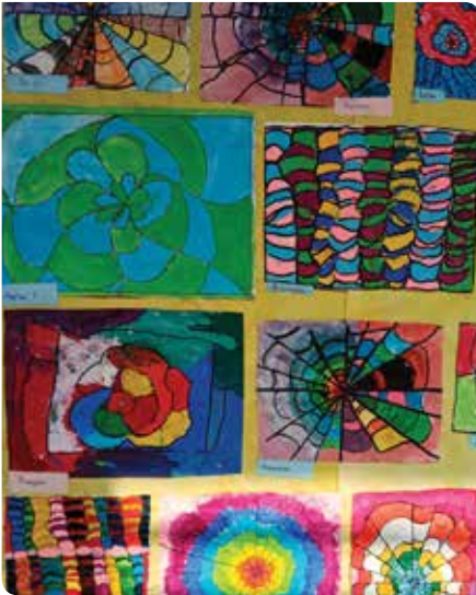
Grade 4 displays their art work showing optical illusion.