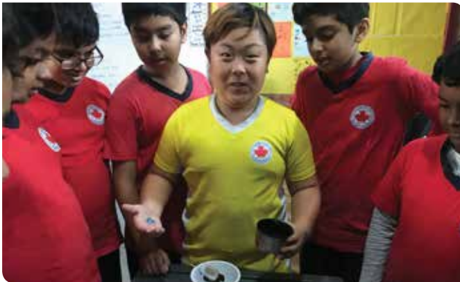
Creating a turbine. A science project for experimenting with water energy.