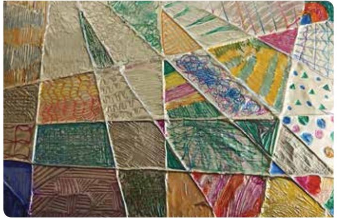
This is Grade 4's final foil work.