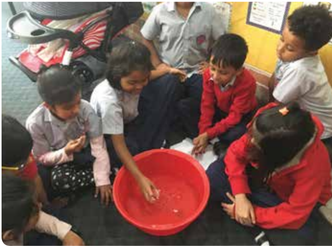
Experiments to prove that air is a gaseous substance that surrounds us and whose movement we feel as wind.