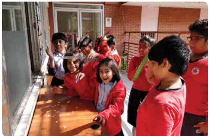
Grade 3s learning about static electricity.