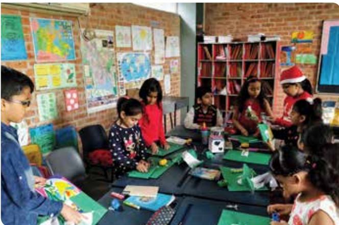
Excited about Santa's Christmas gifts!