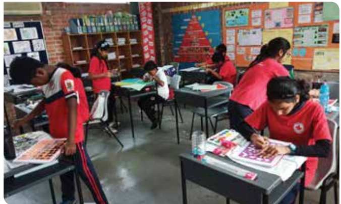
Enjoying art class using various objects.