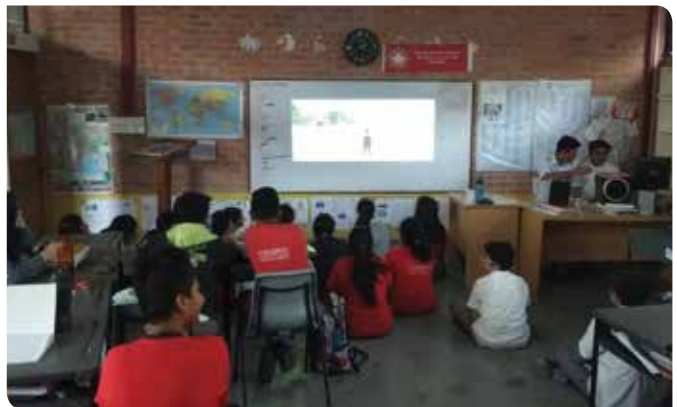
The grade 7s proudly showing their music videos to the grade 8s.