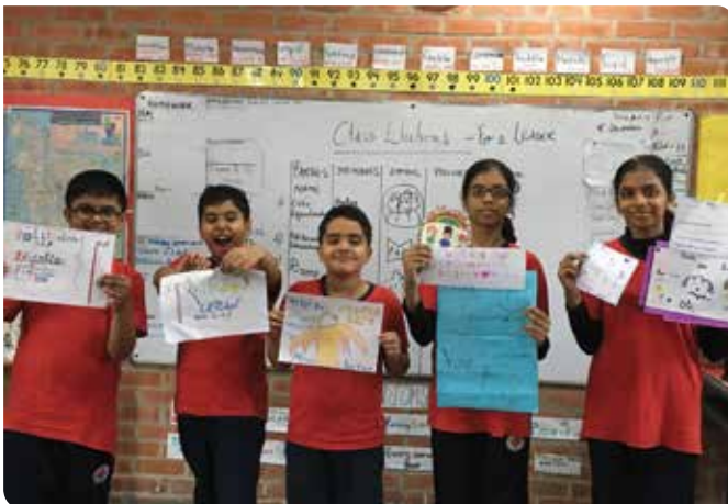
Our symbols, slogans, policies for class elections in social studies.