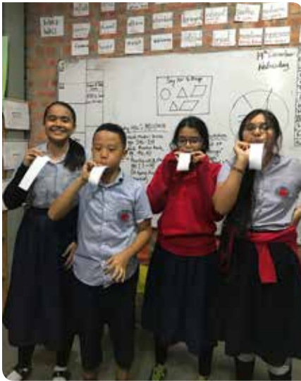
A science experiment. Air in motion.