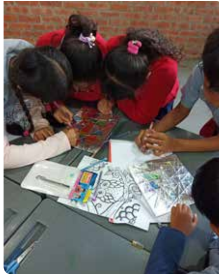
Working on foil art work with glitter pens.