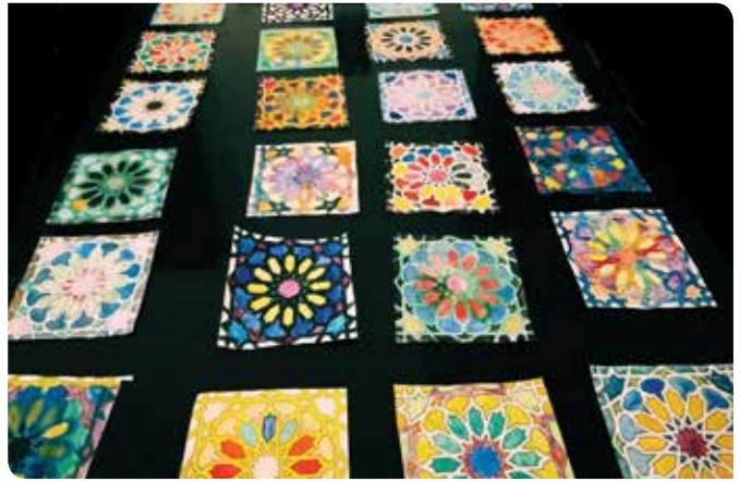
Creative Art at it's best.