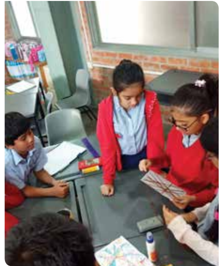
Grade 4 students working on foil art work using strings!