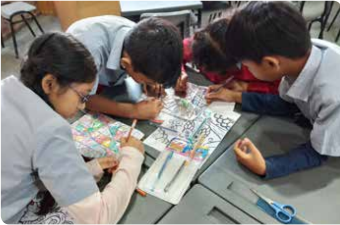
Hard at work on foil art.