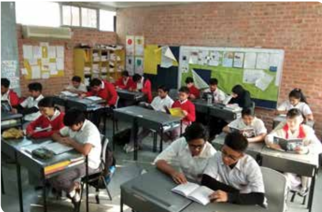
Students are engrossed in their reading of The Outsiders - a classic novel dealing with themes of class conflict, loyalty, and choices.