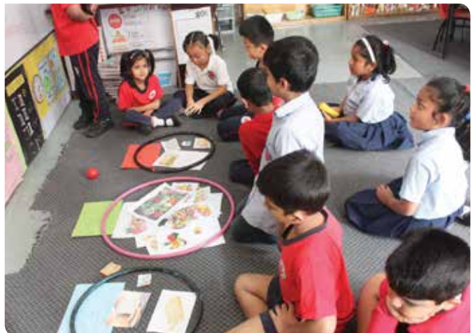
Identifying and sorting pictures of Canada's 4 basic food groups.