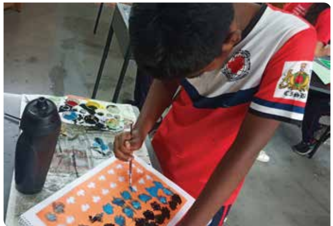
Stamp Art! An interesting way to create design.