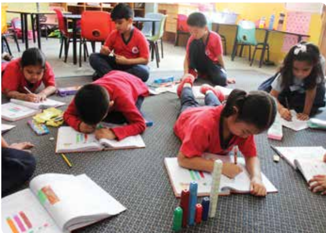
Grade ones went on a survey to grade two, collected data and interpreted findings into a bar graph using snap cubes.