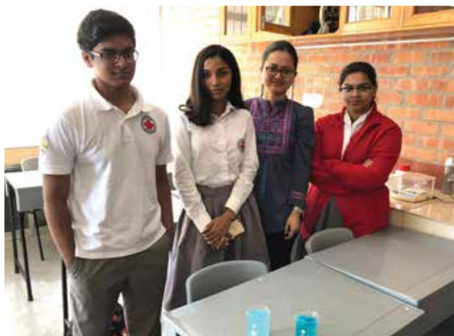
Grade 11 Chemistry students prepare a solution 0.1 Molarity and 0.1 by mass of [copper (II) sulphate] crystals.