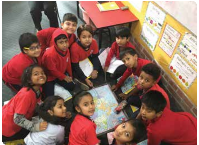
Exploring the Canadian Provinces and Territories on a map.