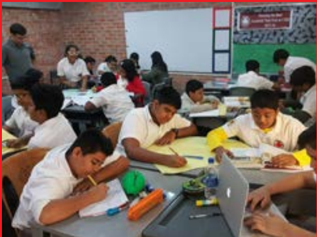
Grade 7's creating concept web posters on THE WAR OF 1812 as part of their Social Studies project.