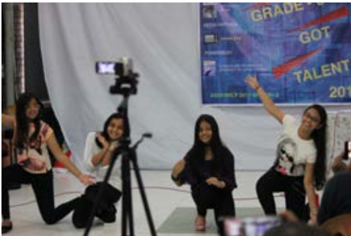
Grade 6 performing at their Recognition Assembly.