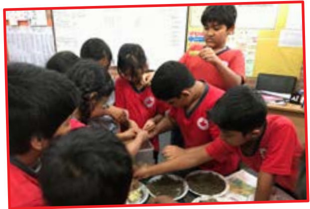
Students are creating composting bucket for their school using organic materials.