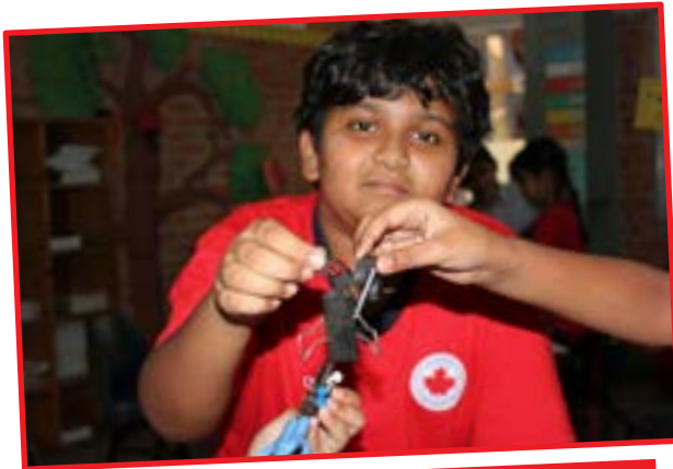
Magnets pick up magnetic object! A hands on activity in Science Class.