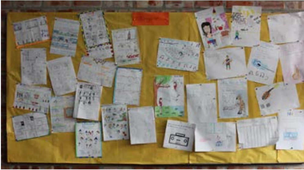
Grade 6 Board display of animation stories and illustrations for poems.