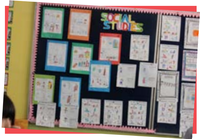
Rules are very important everywhere. Grade 1 made their own rules about playing safely in the playground.