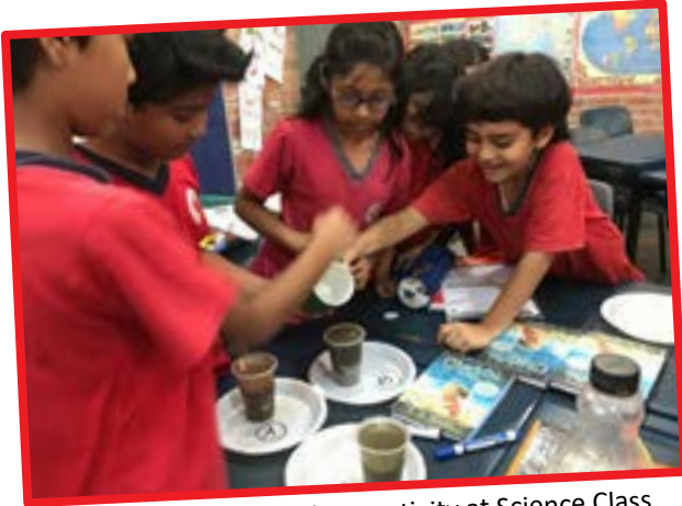
Separating Soil a hands on activity at Science Class.