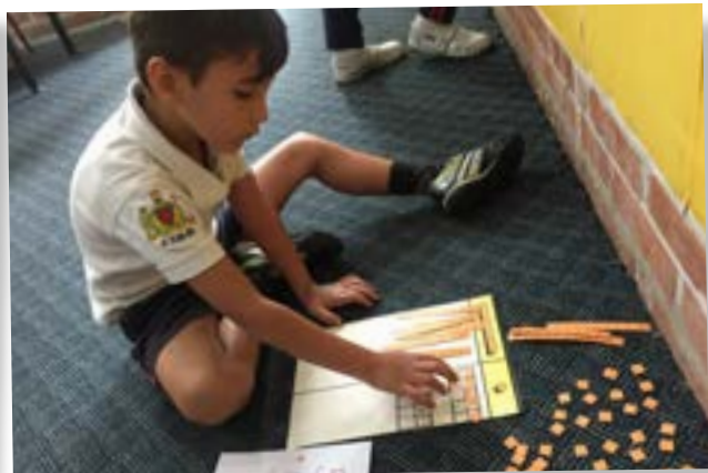
Children are demonstrating addition story problems on the place value mat.