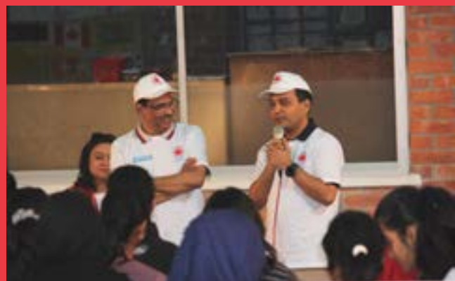
2017 DISA High School Boys and Girls Badminton Tournament at CISB sponsored by SNOWTEX