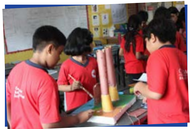
Grade 4 students built castles as a part of their English and Social Studies lessons to learn all about the life of Kings, Queens, Knights and Kingdoms.