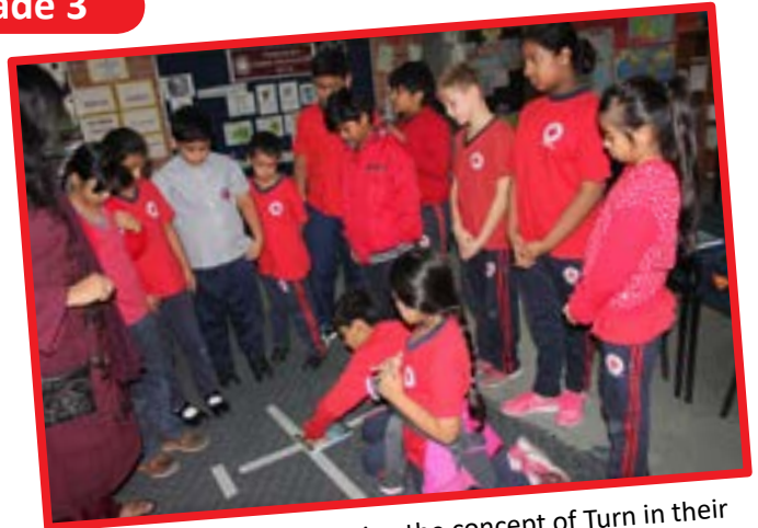
Grade 3 students are learning the concept of Turn in their Math Class.