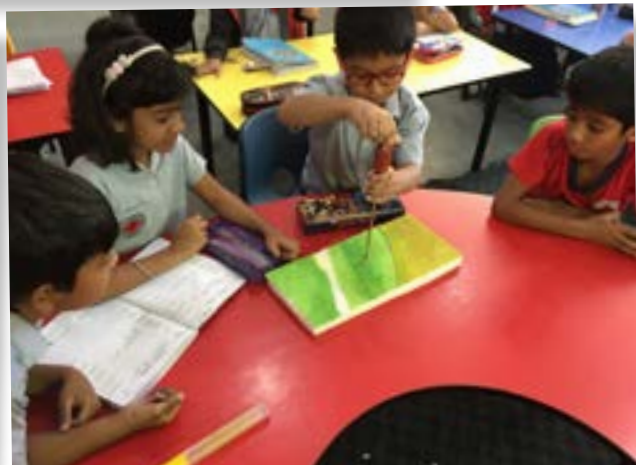
Experimenting that a screw is a simple machine that has an inclined plane wrapped around a cylinder.